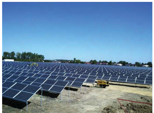
AP Alternatives has installed solar projects totaling over 100 megawatts across the U.S. including this 4,117 kilowatt project in Napoleon, Ohio.

AP Alternatives started by designing a system that could utilize automated equipment to manufacture components as well as assemble them. Designs led to a fully pre-panelized modular racking system that allows for factory quality control and rapid field installation. Alex Products manufactures many of the racking components and specialized assembly equipment.