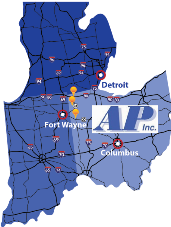
Alex Products' Ohio locations.