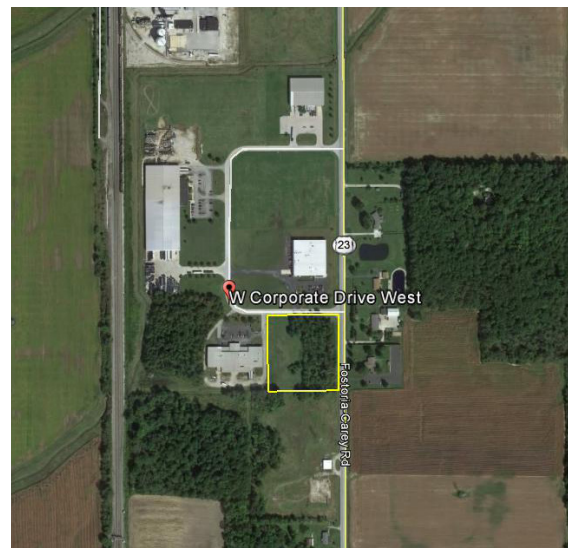
North Central Electric Cooperative and Ohio's Electric Cooperatives provided a $10,410 grant to clear trees to prepare the 4.1-acre site in Fostoria Industrial Park for immediate development.

FEDC's Smith adds that the 4.1-acre site has all utilities at the site and can accommodate a 30,000-square-foot building plus parking.