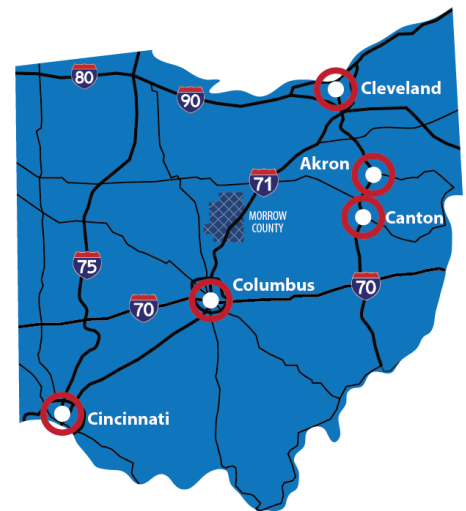
Morrow County is located midway between Cincinnati and the Akron/Canton and Cleveland metro areas.

Significant multi-year investments in infrastructure, community planning, and private development have laid the foundation for new growth that will simultaneously maintain the charm of the county's rural villages and recreation areas while providing new sites for additional light manufacturing facilities. The hard work has provided direct access to water, sewer, natural gas and fiber to over 1,000 acres of ground between the County's two interstate interchanges.