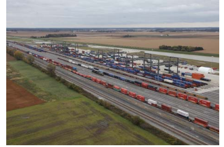
By early 2015 there will be a total of 7 ultra-efficient Kuenz RMG wide span electric cranes in the North Baltimore intermodal terminal. The cranes create no emissions in their operations and generate a portion of the electricity required to operate them.

CSX is one of North America's seven Class I railroads with a transportation network spanning