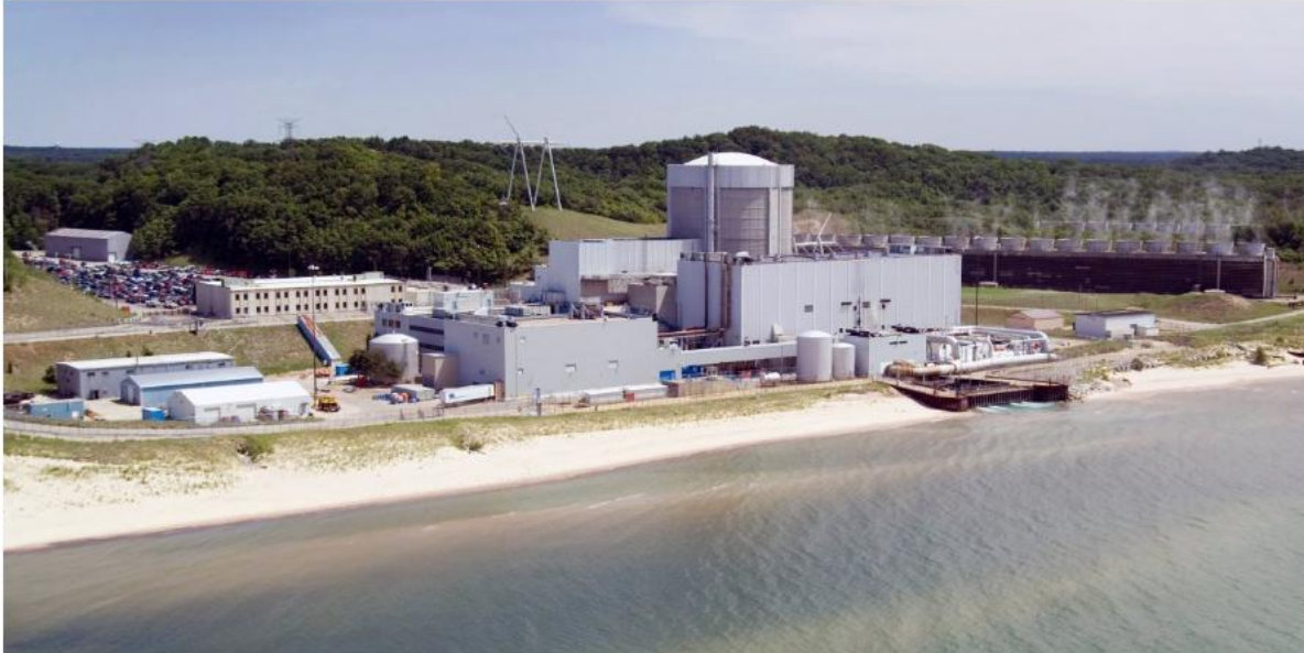
The Palisades nuclear power plant.